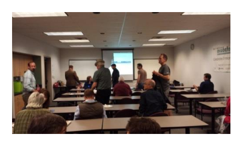
The Santa Fe Software Developers Meetup included a presentation on new artificial

intelligence that received a thumbs up review from attendees.